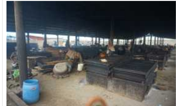
Smoking equipment and other devices deteriorated