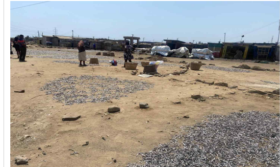
Current fish drying method (fish placed on the ground for drying)