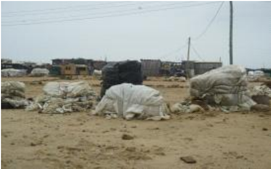
Current storage method for processed seafood