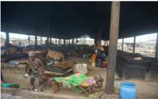
Fisherwomen and children living on site