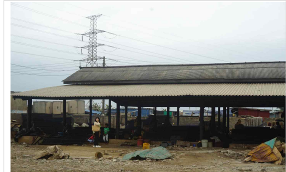
Frequent flooding due to the facility's location in a low-lying area