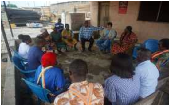
Conference of the Tema Harbor Fisherwomen Association